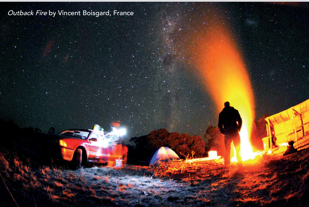
Outback Fire by Vincent Boisgard, France

Left: "This shot was taken in South Australia during a road trip through the Nullarbor Plain, representing the magic of the Australian twilight but also the magic of being a part of an adventure and fantastic times," says Vincent Boisgard.