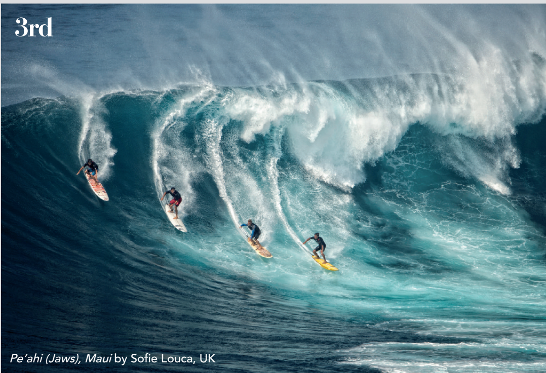
Pe'ahi (Jaws), Maui