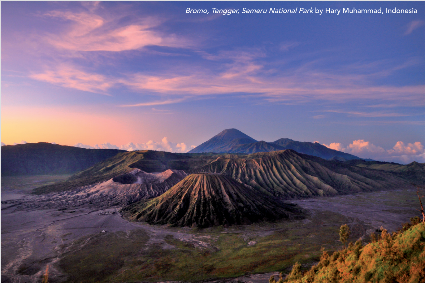
Bromo, Tengger, Semeru National Park by Hary Muhammad, Indonesia

WWW.FLICKR.COM/PEOPLE/HARYMUHAMMAD @HARYMUHAMMAD