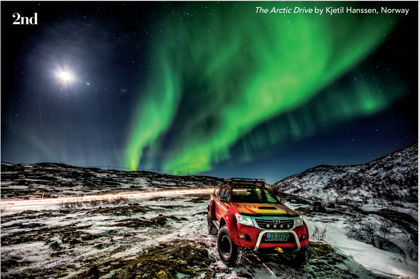
The Arctic Drive by Kjetil Hanssen, Norway